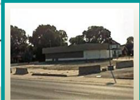
Information is deemed reliable, but is not guaranteed and should be independently verified.