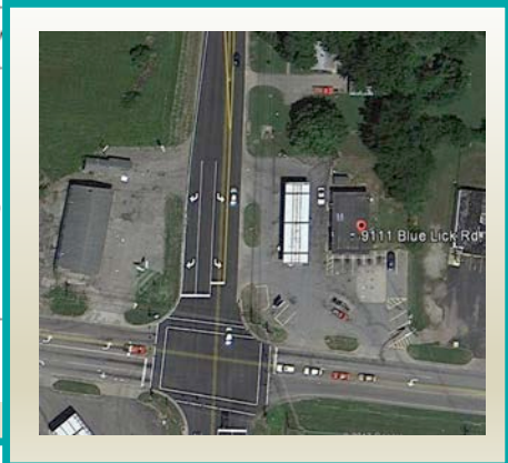
Information is deemed reliable, but is not guaranteed and should be independently verified.